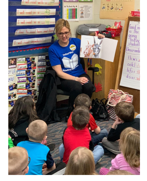
Our volunteers are currently reading at the following school districts: Brimfield, Suffield, Kent (Walls), Ravenna (West Park), Rootstown, Streetsboro and Windham.

Sign up on our <u>volunteer website</u>, bring your favorite books to the class and share your love of reading with the students!