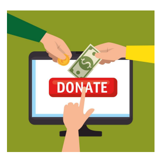
Visit our website www.uwportage.org